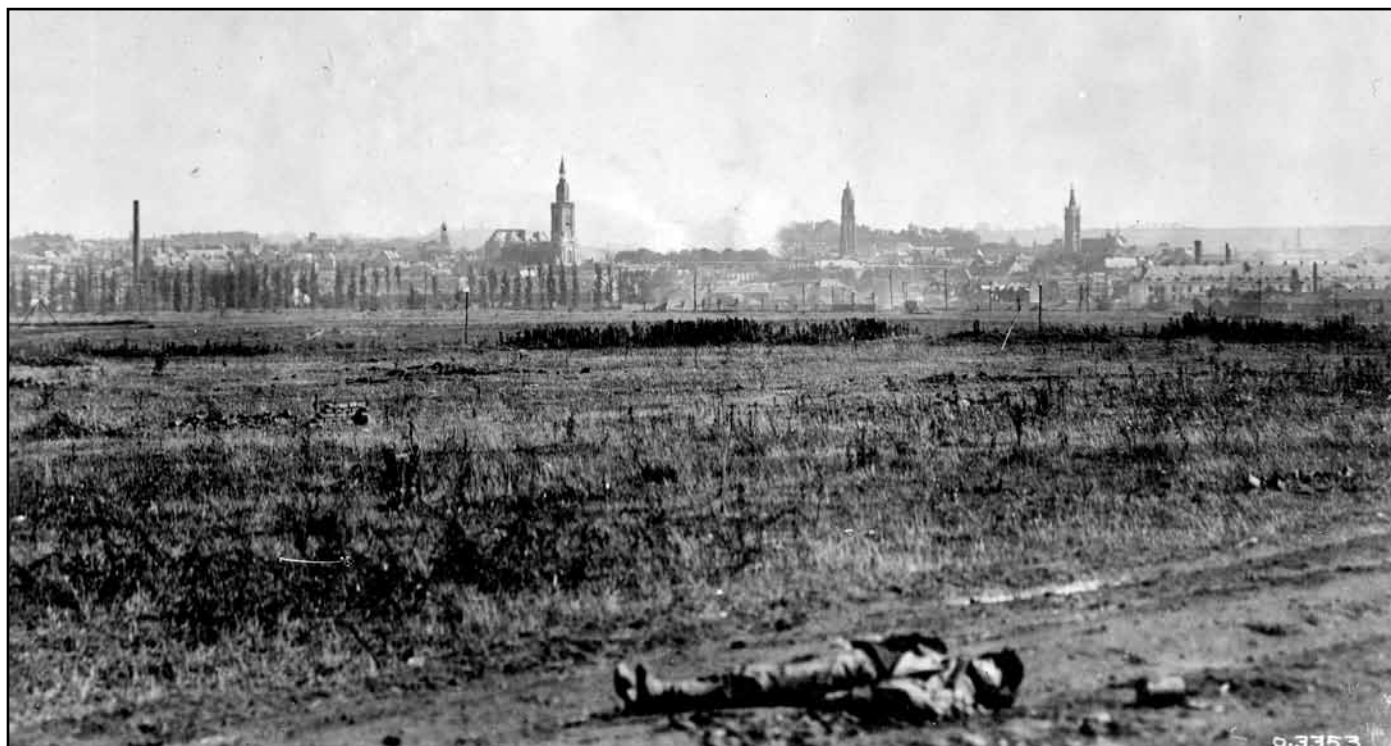
Cambrai as viewed from the Canadian front line, 1 October 1918. Note the dead soldier lying in the foreground.

By the summer of 1916, in the Somme campaign the gunners were employing a "creeping barrage" technique. The artillery barrage moved through the enemy's defensive positions according to a strict time schedule. As the artillery barrage "crept" along these positions, the infantry would advance, staying as close to the barrage as possible. "The creeping barrage was a vital innovation in Great War tactics because it represented a decisive shift from 'destructive' fire to 'neutralizing' fire." 55 The intended result was that the German defenders would have