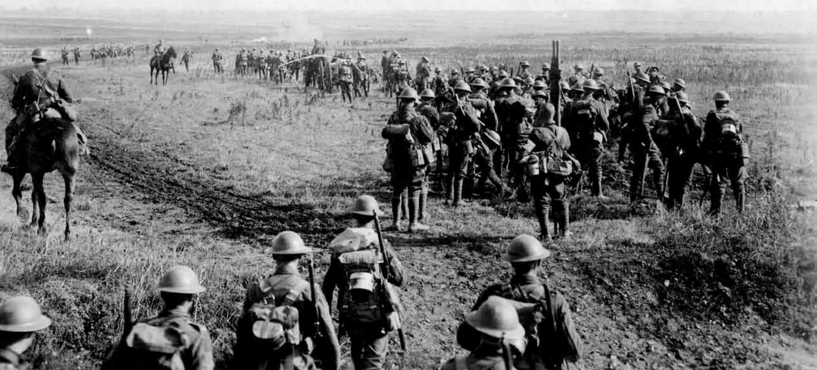
Canadians moving forward into attack on Cambrai.

By nightfall the Red, Green and Blue Lines had been reached but the second phase objectives, the Canal