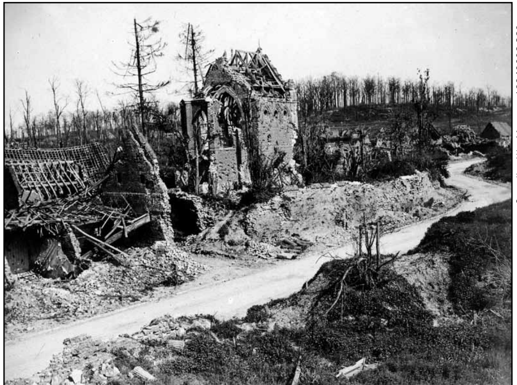
Right: The ruins of Bourlon as they appeared in 1919. In the foreground is the shattered remains of a church while the heights of Bourlon Wood can be seen in the distance.