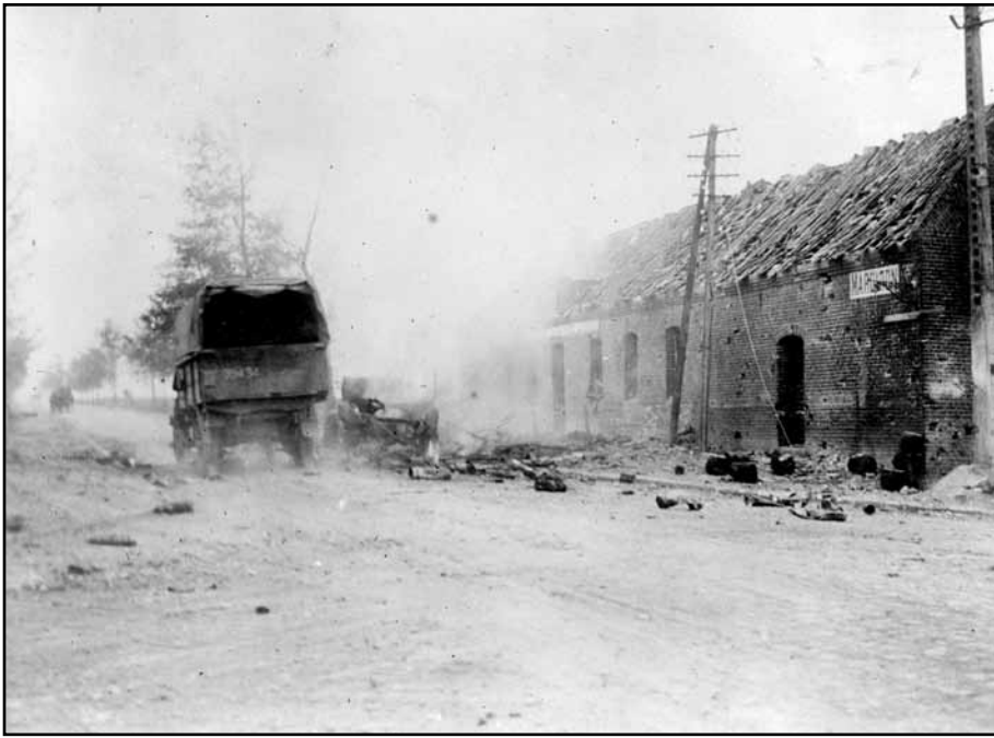
Canadian trucks pass through Marquion as they transport shells to the guns, September 1918.

de l'Escaut and the heights near the city of Cambrai, were still held by the Germans, who were not idle. "[T]he enemy had gauged the strength of our advance," in the words of the war diary of the 2nd CIB, "and had found courage...to cling to and reinforce his strong positions on the high ground...and at dusk was assembling in strong force and in excellent positions to dispute our further advance." 27 Thus the Canadian Corps became engaged in vicious fighting as the Germans counterattacked at a number of locations attempting to recapture the ground they had lost. For the next five days, tired Canadian soldiers pushed on towards the heights around Cambrai against well-entrenched German positions, "Enemy machine guns fired at point blank range. A perfect hell of bullets swept about them and yet they went against these wire entanglements and calmly commenced to tear a passage through them." 28 The war diary for 7th CIB reported "Heavy casualties resulted from machine gun fire...Opposition was strong and progress difficult." 29 The tenacity of the Canadian soldiers won out and by 1 October all the objectives designated by Currie were captured.