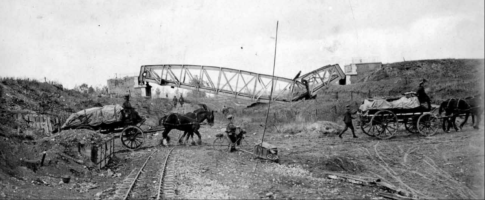
Supply wagons cross the dry bed of the Canal du Nord as they move supplies to the front, September 1918.

harder for victory on 27 September than the Canadian engineers." 39