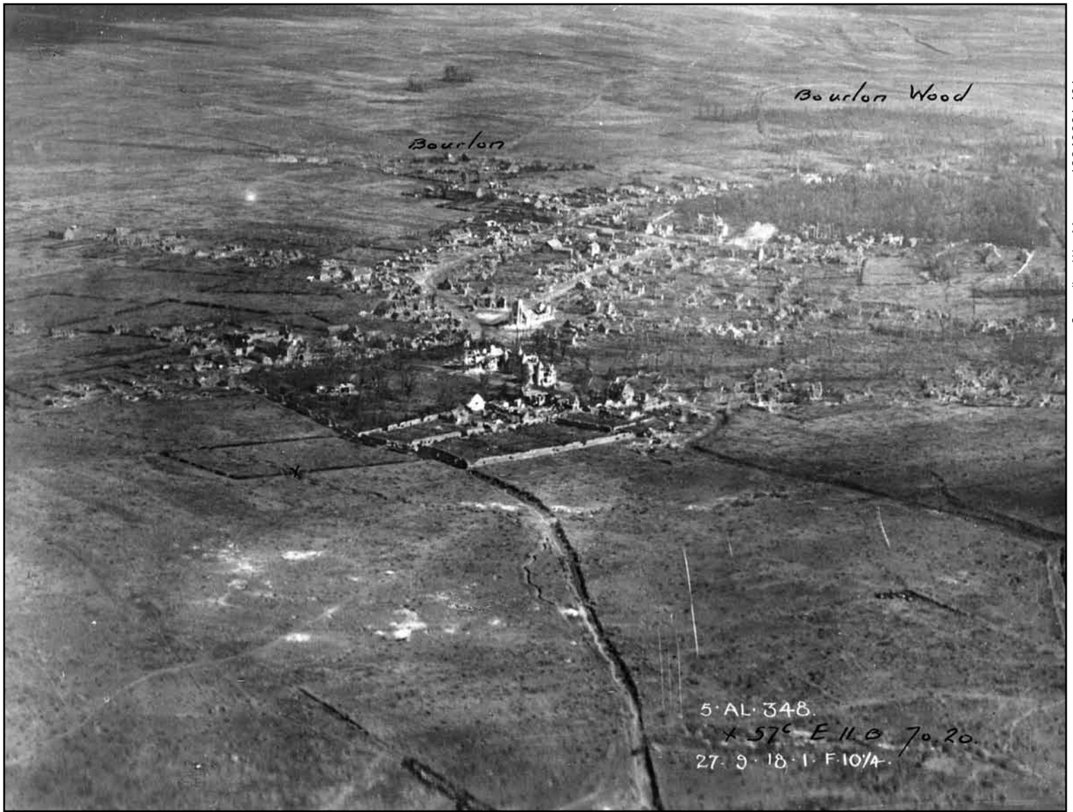
Above: This air photo of Bourlon and Bourlon Wood was taken on 27 September 1918, the first day of the offensive and looks eastward from behind the Canadian front line. The village of Bourlon has been wrecked by the fighting of 1917-18.