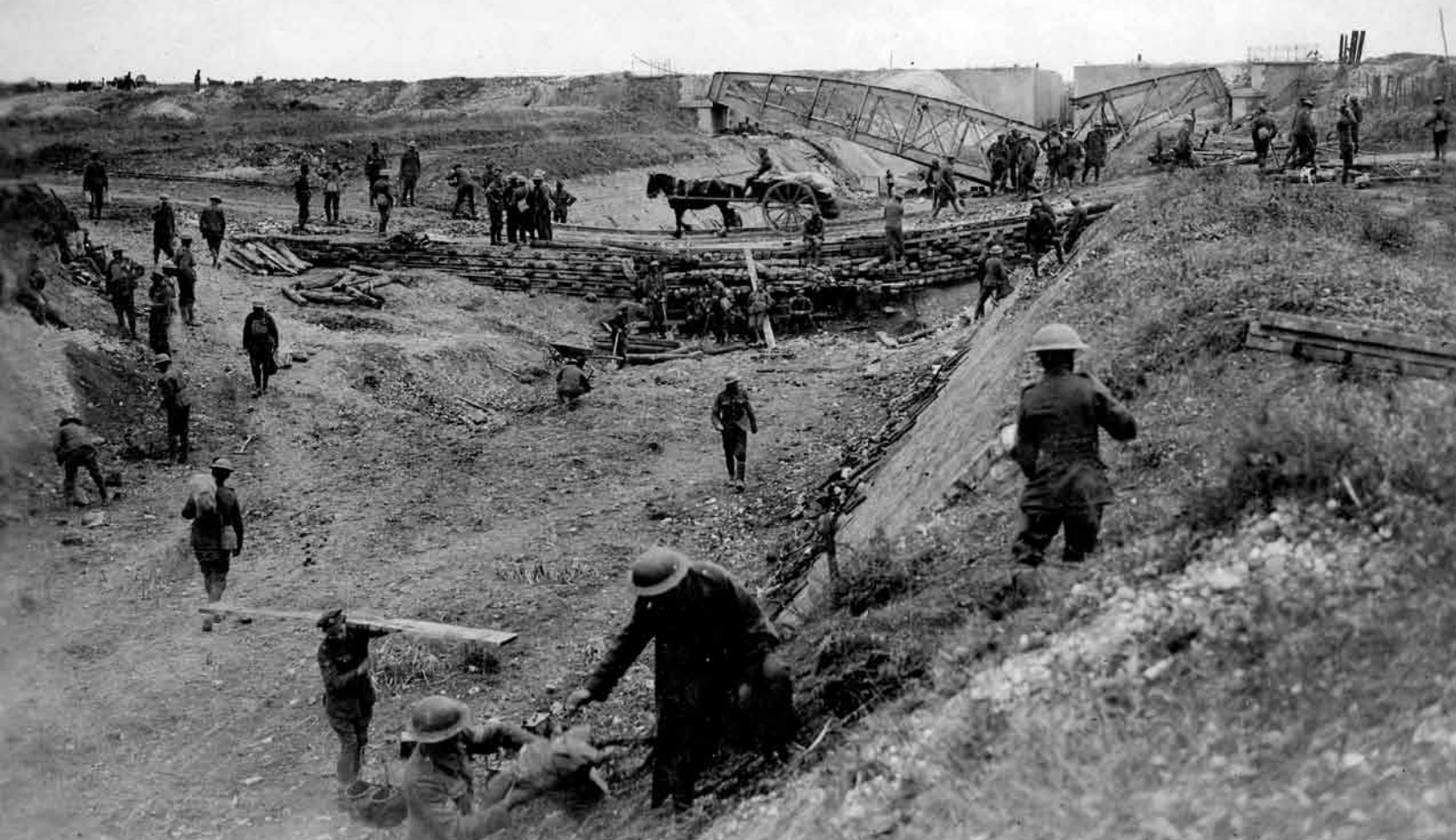
Canadian engineers bridge a dry section of Canal du Nord, September 1918. Note the original bridge blown by the Germans in the background. Behind that is a concrete lock on the canal.

No. 3 sub-section reported to 5th battery...The battery did not move forward until 8:15 am following the low ground north of Inchy. The sappers went ahead of the