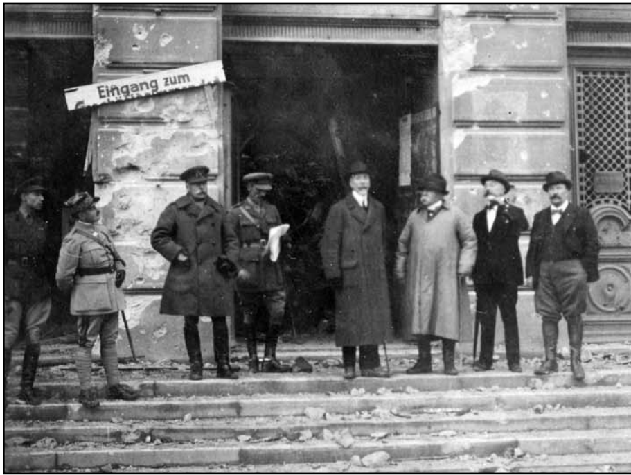
Allied leaders meet on the front steps of the Cambrai city hall in October 1918. The group includes Field Marshal Sir Douglas Haig (third from left); Lieutenant-General Sir Julian Byng (fourth from left); and French prime minister Georges Clemenceau (third from right).

evolution of the BEF's artillery, from the unscientific and 'rule of thumb' approach of 1914 to the distinctly scientific and highly accurate gunnery of 1918 was the factor, more than any other, that brought about victory." 62