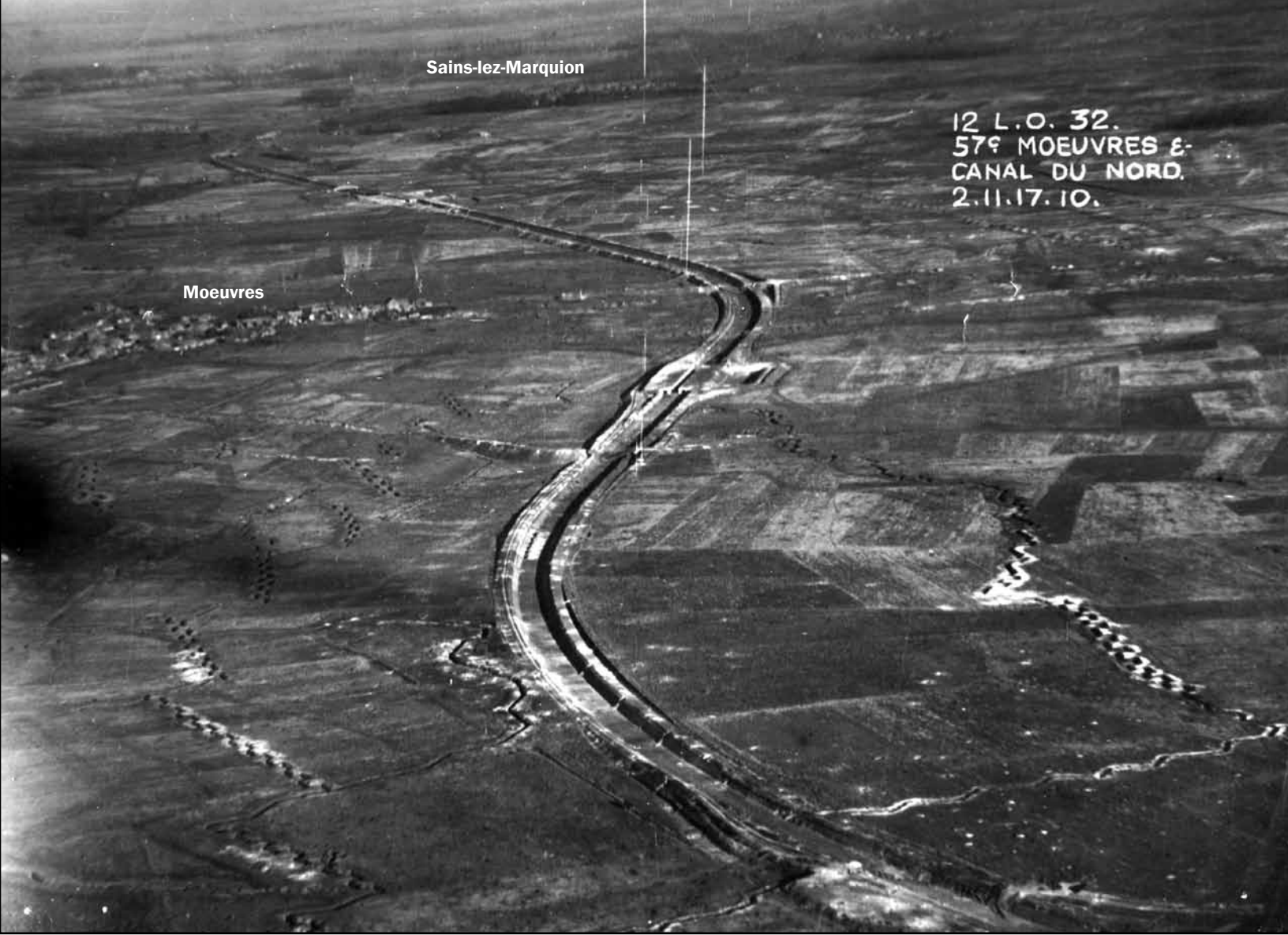
Taken nearly a year before the battle (2 November 1917) this oblique air photo shows the dry bed of the Canal du Nord as it snakes past Moeuvres towards Sains-lez-Marquion. The zig-zag lines of trenches are only the most visible part of the formidable defences on either side of the canal.

wire.” 8 Farther back and parallel to the canal was another heavily wired defensive network, the Marquion Line, and behind that stood the imposing heights of Bourslon Wood a position which was “difficult to assess from air photographs because of the foliage still on its magnificent oak trees...But the ground between the wood and the Marquion Line was dotted with old excavations, dug-outs and shelters, all of them potential machine-gun sites.” 9 It was hard to fathom that after overcoming two heavily defended positions the Canadians would then be expected to assault a dense forested area on high ground.